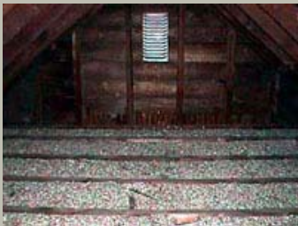
Vermiculite insulation found in an attic.

Heating system insulation Spray-applied insulation Vinyl floor tiles Vinyl sheet flooring Ceiling tiles Adhesives and construction mastics Roofing paper and shingles Cement siding shingles Plaster and joint compound Vermiculite