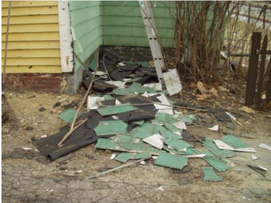
Improperly removed asbestos from home renovation project.